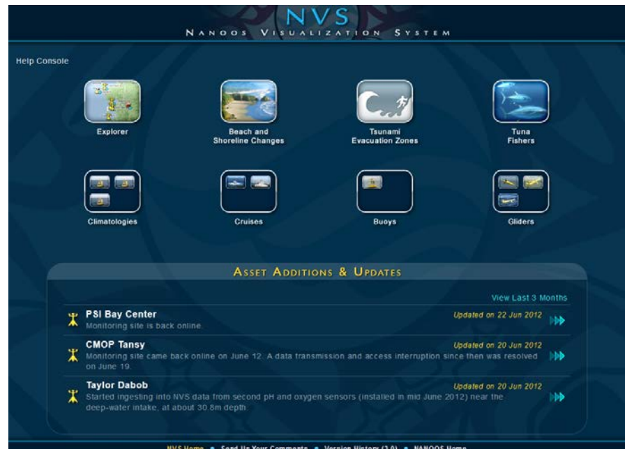
Figure 2: The new NVS web application GUI under development